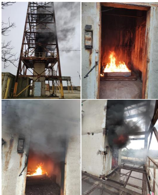
Fig. 1 - Cable tunnel of the NPP during the experiment.

The cable floor of the reactor compartment of the main building of the NPP, with a height of 6 meters, at an elevation of 33,200 m of the reactor containment of the VVER-1000, with an internal space measuring 2600×1800×6000 mm. The thickness of the enclosure of the cable tunnel is as follows: side walls - 200 mm, ceiling slabs - 200 mm. The combustible material of the electrical cable is polyvinyl chloride, while the materials exposed to heat include steel brackets and steel wires made of St.3sp quality steel. To correlate the results, three experiments were conducted on sections of the vertical cable tunnel of the NPP, which are analogs of the designed building structures of the Zaporizhzhia NPP at different elevations of the vertical cable tunnel (Fig.1).