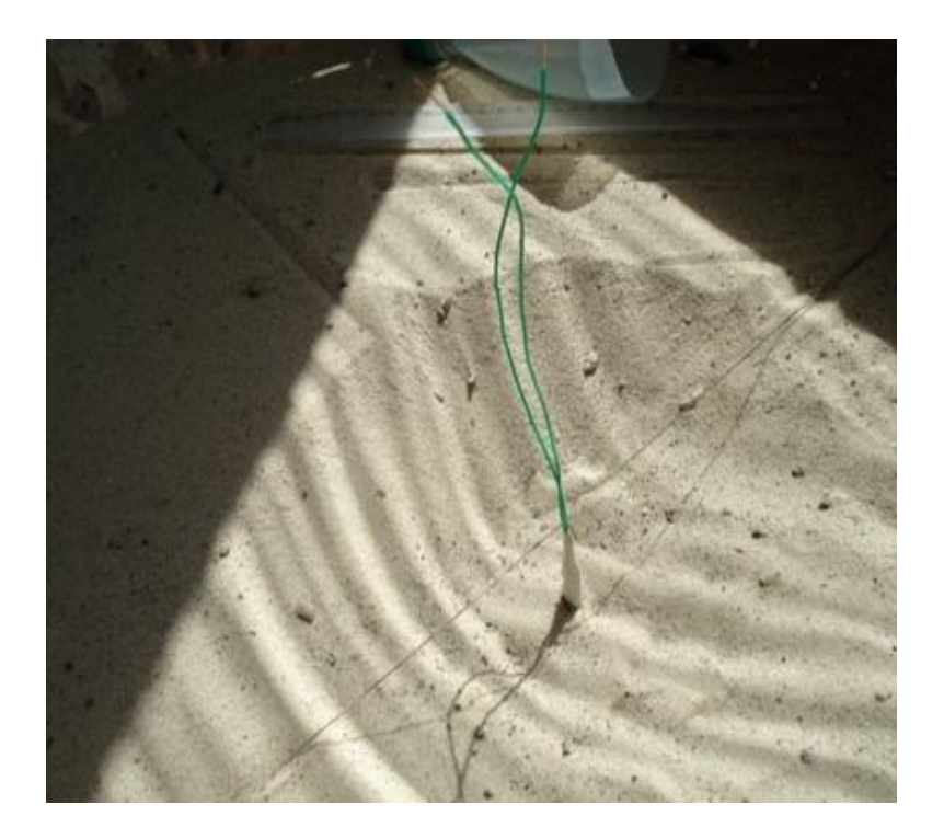
Fig. 1. Modelling elongated charge