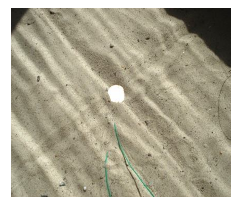
Fig. 2. Metal disk over the charge

During the experiment three parameter were fixed: magnitude of recess of the upper end of the charge under a source surface of a soil massive, magnitude of subsidence of sand in the container after detonating, and a depth of immersion in soil of the metal disk which had to confirm the presence and scale of the effect of the ground vertical fall acceleration from high layers in the cavity during the pulsating movements in the cavity and the surrounding massive. Results of the studies are on fig. 3 - 4.