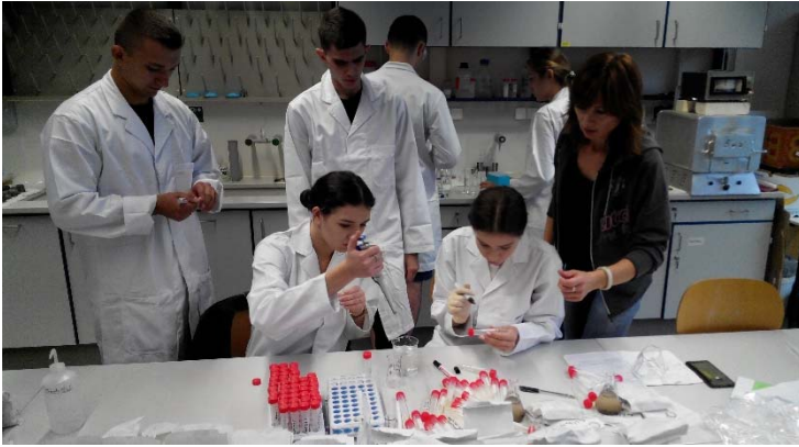
Fig. 3. Ukrainian students in Phytomining lab