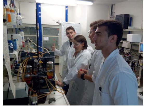
Fig. 3. Working in Microbiological lab

7) Establishment of the biomining laboratory. In 2017, the biotechnological lab at the Department of Ecology and Environmental Technologies of DUT was launched. It allowed students to carry out basic experiments related to bioindication and environmental risk assessment.