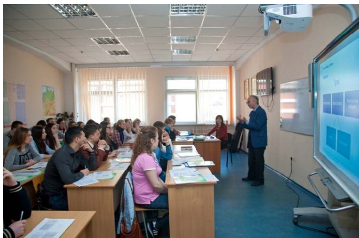
Fig. 2. Lecture of Prof. H. Heilmeyer on Phytomining

3) Five weeks practical lab training for DUT students at TU BAF. In 2015 and 2016 TU BAF professors provided intensive lab courses for DUT students related to the Phytomining and Bioleaching area of research (Fig. 3-4.). Students studied the research technics for: