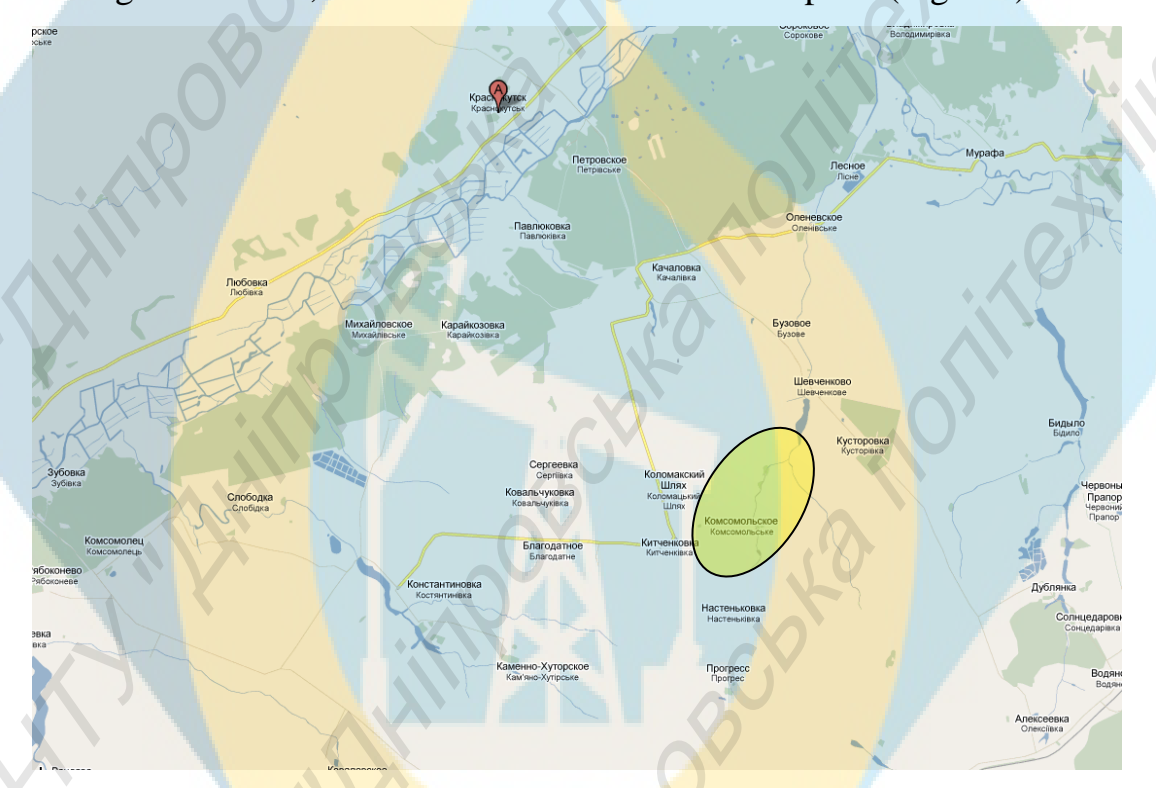
Figure 1.1 - Location of Sakhalinsky deposit

Sakhalinsky oil and gas condensate deposit was discovered by DP Poltavanaftogazgeologiya in 1981 year. Administratively, the deposit is located in the Krasnokutsk district of Kharkiv region of Ukraine. In the area of the deposit, there are villages: Kustorovka, Komsomolskoye, Nastenkovka. The town of Krasnokutsk, which is a regional center, is located 10-15 km from the deposit (Fig. 1.1).