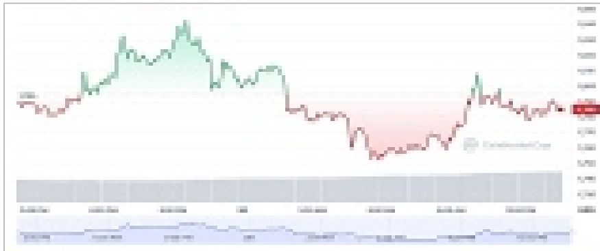
Fig. 2. Chart of Ethereum to the USD.

DeFi (decentralized finance) and NFTs (non-fungible tokens). These applications are based on the Ethereum blockchain and require fees to be paid in ETH. The price of Ethereum is $1784.53 with a 24-hour trading volume of $11,777.29 million. Ethereum has fallen by 0.38% in the last 24 hours. It ranks 2nd on CoinMarketCap with a real market capitalization of $218.38 billion USD. There are 122,373,866 ETH coins in circulation (Fig. 2).