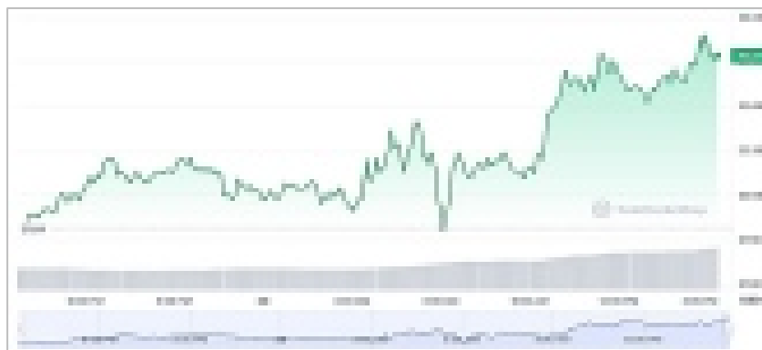
Fig. 3. Chart of Solana to the USD.

Solana (SOL) is a cryptocurrency with a fixed maximum emission limit of 489 million SOL tokens. This means that SOL can be considered a deflationary currency within this limit, as the number of coins in circulation cannot increase indefinitely. Solana's main innovation is its speed, thanks to a set of new technologies, including a consensus mechanism called "proof of history." Solana can process thousands of transactions per second, making it scalable and energy-efficient. In November 2022, the price of Solana dropped 40% in one day after FTX liquidity crisis triggered a sell-off by Alameda Research, as Solana was the second-largest holding of Alameda. At the time, FTX owned $982 million worth of Solana tokens.