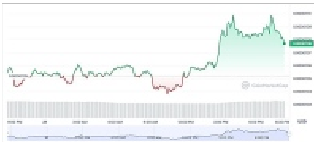
Fig. 4. Chart of the Shiba Inu to the USD.

The price of Shiba Inu is $0.000011 with a 24-hour trading volume of $302.02 million (Fig. 4). Its current CoinMarketCap ranking is 13th with a real market capitalization of $6,377.31 million. It has a circulating supply of 589,543 billion SHIB coins.