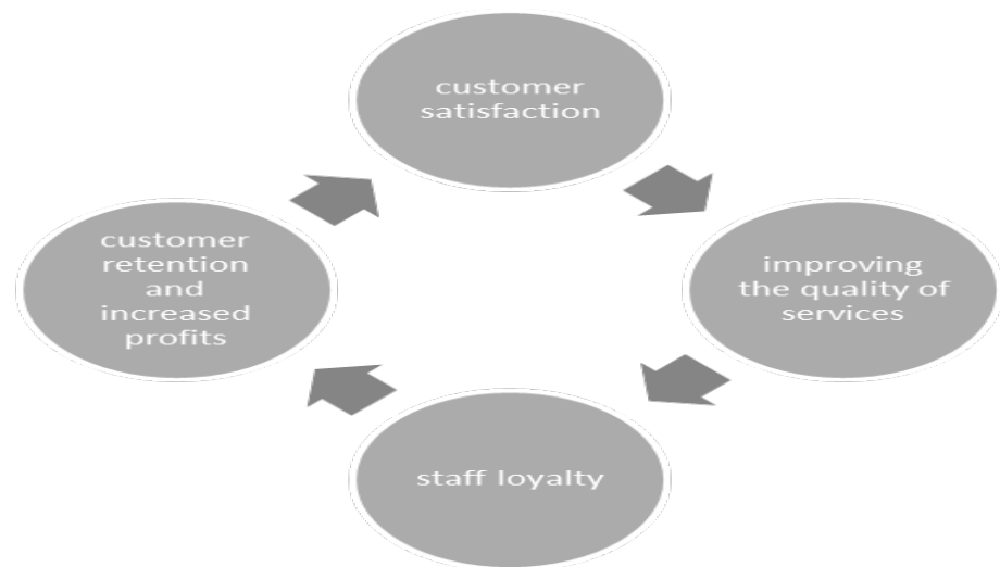
Fig.1. The scheme of relationship marketing

When these relations are established, the client demonstrates his loyalty.