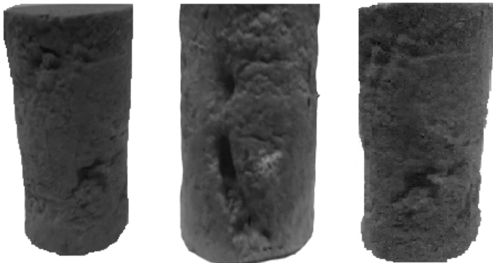
Figure 2 – Erosion in loess samples for filtration technique taking place in parallel with stratum

The most intensive process of the particles evacuation (72% of total mass) took place from 2.5 to 6.0 hours in terms of the filtration start. Fig. 2 demonstrates that in the majority of cases the period takes noticeable changes in the sample volumetric deformation values.